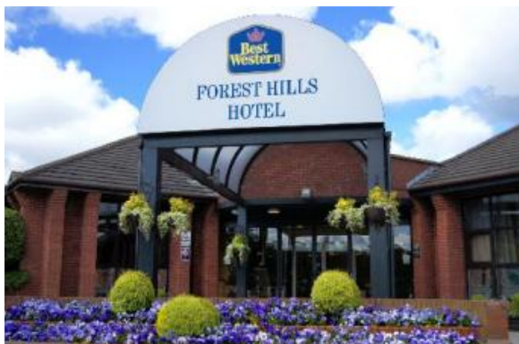
Forest Hills Hotel, Frodsham