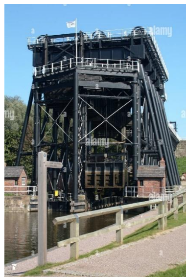
Anderton Boat Lift