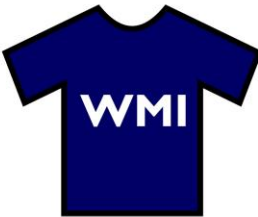
West Midlands Navy Blue