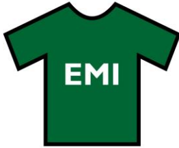
East Midlands Bottle Green