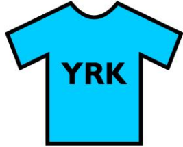
Yorkshire Sky Blue