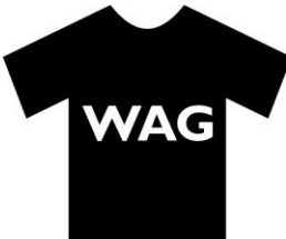
WAGS & Wales Black