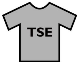
Thames Sth East Grey