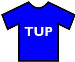
Thames Upriver Royal Blue