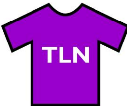
Thames London Purple