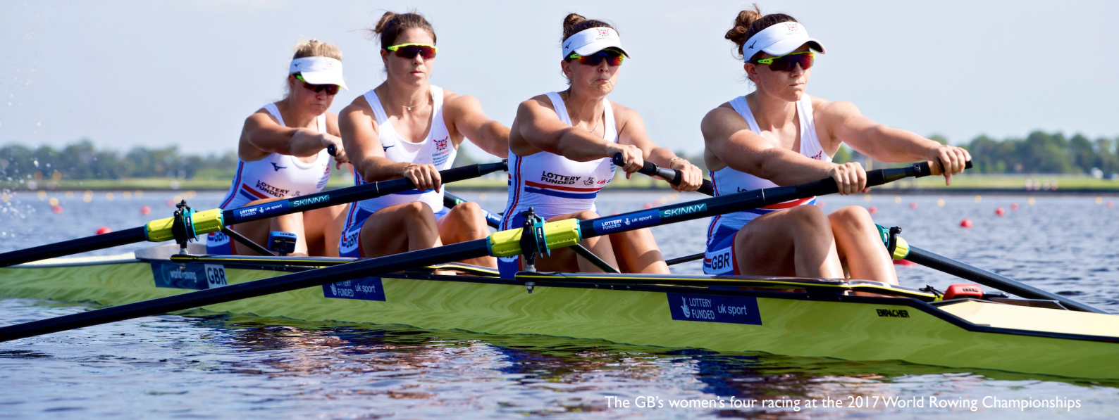
The GB's women's four racing at the 2017 World Rowing Championships