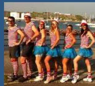
Where's Wally? A team at the Plymouth Rowing Forum Challenge, May '12

'Row for Gold' allows clubs to access marketing materials & log their event on a database. Register YOUR event at www.britishrowing.org/taking-part/row-for-gold .